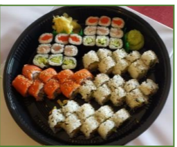
Party Tray B