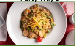
Lee's Fried Rice