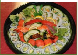
Party Tray D