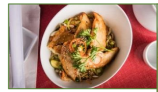
Chicken Teiyaki Bowl